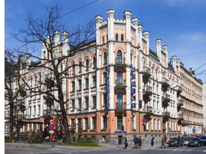
MONIKA CENTRUM HOTEL, RIGA

strolling through its cobble-stone and picturesque streets. The walking tour of the Old Town includes the Dome Cathedral, Church of St. Peter, Large and Small Guilds, Riga Castle, Three Brothers, Blackheads House, Swedish Gate and a walk through Trokšņu , one of Riga's narrowest streets. Check into Monika Centrum Hotel (B)* .