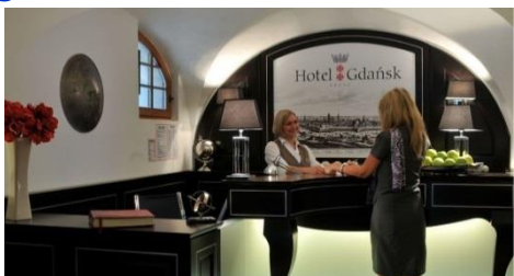
HOTEL GDANSK BOUTIQUE

MON. AUG. 13. DEPART USA. Board your flight to Gdansk, Poland. Make your own flight arrangements.