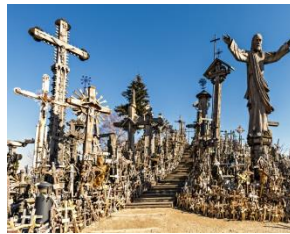
HILL OF CROSSES

FRI. AUG. 24. RIGA. Hot breakfast buffet at hotel. Enjoy day of leisure OR : Optional full day tour of Hill of Crosses and Rundale Palace . Farewell Banquet (B, D)*