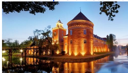
HOTEL KRASICKI, LIDZBARK WARMINSKI

Cathedral. Organ concert in the church. Next transfer to Sopot and visit the Bohaterow Monte Cassino Promenade, Pier and South Park.