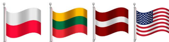
FLAGS OF POLAND, LITHUANIA, LATVIA & USA

ABBREVIATIONS: B=Breakfast, D=Dinner included in tour price.