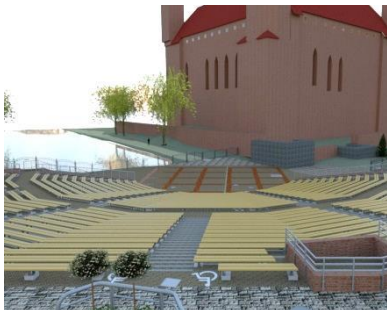
LIDZBARK WARMINSKI AMPHITHEATER

OPTIONAL 3 – Frombork: $85/pp. Frombork is a small fishing port on Vistula Bay and an important sailing and ice-boating center. It is also the seat of Warmia Bishopric since the 13th century. In Frombork Nicolas Copernicus –the great Polish astronomer –spent 30 years of his life and made some of his famous discoveries. He died in Frombork and is buried in the Cathedral. See some of the city's top sights, e.g. Cathedral Hill and Copernicus Museum . The hill offers a sweeping view over the Vistula Lagoon and Sandbar .